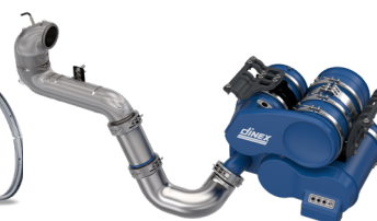
Euro 7 Solutions