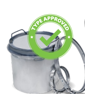
Type Approved DPFs